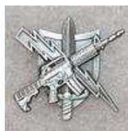
Patrol Rifle operator badge

After completing the respective requirements the participant will be awarded with the following badge: